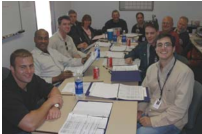
DPMU Team: (left to right in rotation)

The initial DPMU Team has been assembled to cover a wide spectrum of talents. Their first organizational meeting was held March 4 th at the warehouse.