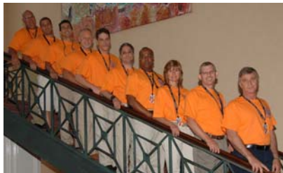
The "Orange Shirts" at the Annual Training session.

As equipment is accumulated, the DPMU Team will organize it into functional groups in tote boxes identifying the section, contents of each tote, and weight. These will be palletized by section for transport by trucks rented upon deployment.