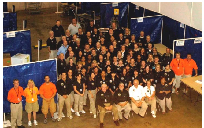
2010 Annual Training

Day 3 addressed Haz-Mat Awareness Training (needed for compliance with NIMS credentialing changes.)