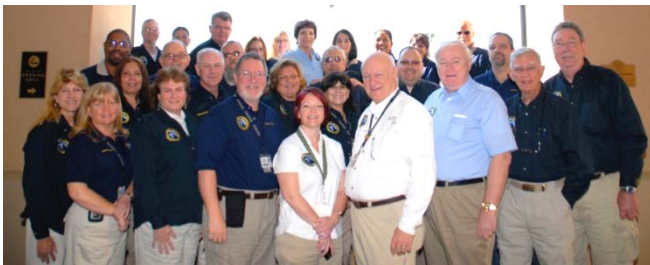
2010 VIC Training