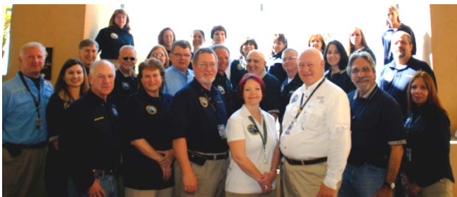
2010 Odont Training